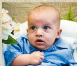
Centre Baby

Your small change makes a big difference to women facing unplanned pregnancy or seeking post abortion grief support.