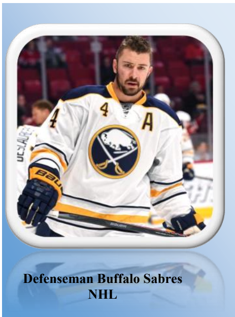
Defenseman Buffalo Sabres NHL