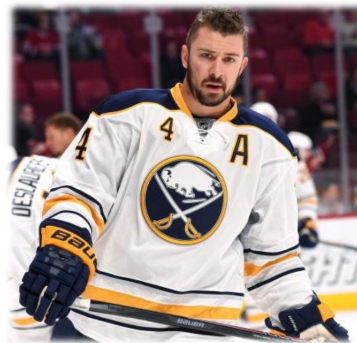
Josh Gorges, NHL Defenseman Buffalo Sabres St. Joseph Catholic Elementary Alumnus