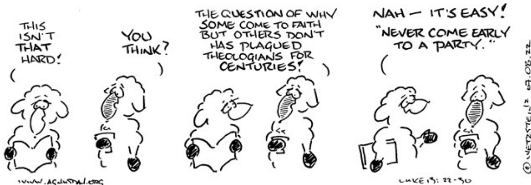
"Agnus Day appears with the permission of www.agnusday.org"

DEADLINE FOR SUBMITTING ITEMS TO BE INCLUDED IN THE BULLETIN IS THURSDAY NOON.