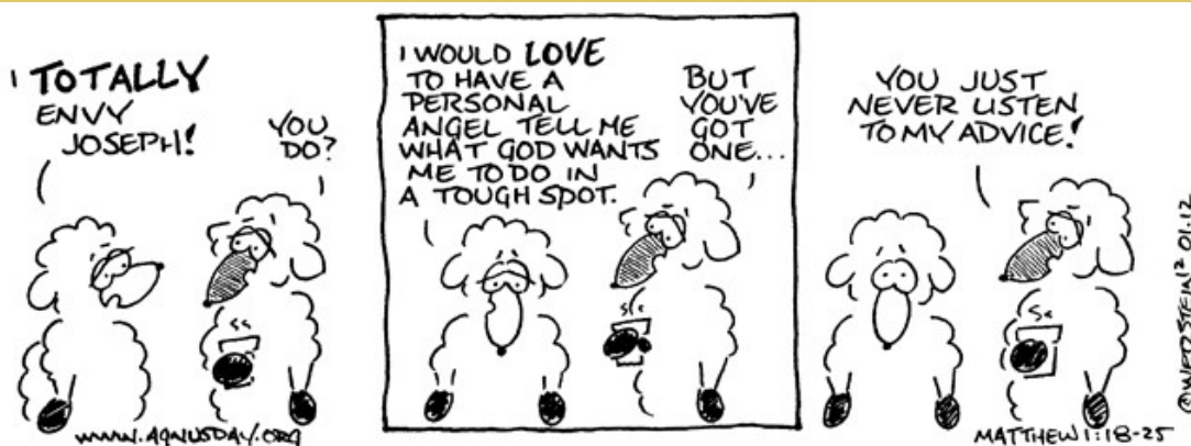
"Agnus Day appears with the permission of www.agnusday.org "

DEADLINE FOR SUBMITTING ITEMS TO BE INCLUDED IN THE BULLETIN IS THURSDAY NOON.