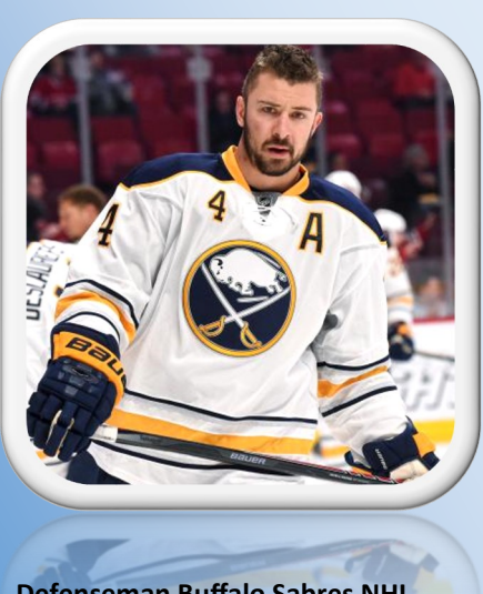
Defenseman Buffalo Sabres NHL