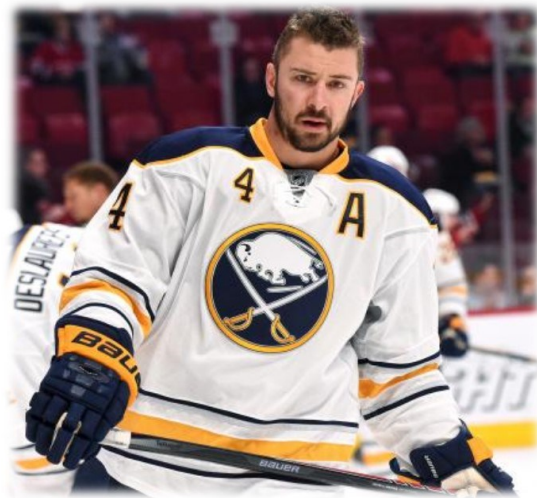
Josh Gorges, NHL Defenseman Buffalo Sabres St. Joseph Catholic Elementary Alumnus