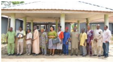
Share the journey with members of the Umuechem community in Nigeria

In 1990, a peaceful community in the south of Nigeria became the victim of what has been recognized as the first crime committed by an oil company. Traumatized by a massacre of unparalleled violence, a large majority of the members of this community fled to neighbouring communities, never to return home again. To make sure that their story is never forgotten and to combat impunity, Development and Peace's partner Social Action is supporting the Umuechem community in their legal action against the oil company.