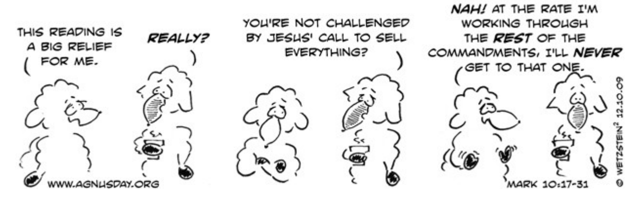
"Agnus Day appears with the permission of www.agnusday.org"