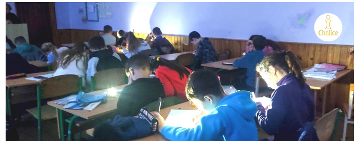
Ukraine Regional Assistance