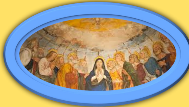
Our Lady with the Apostles and Disciples at Pentecost