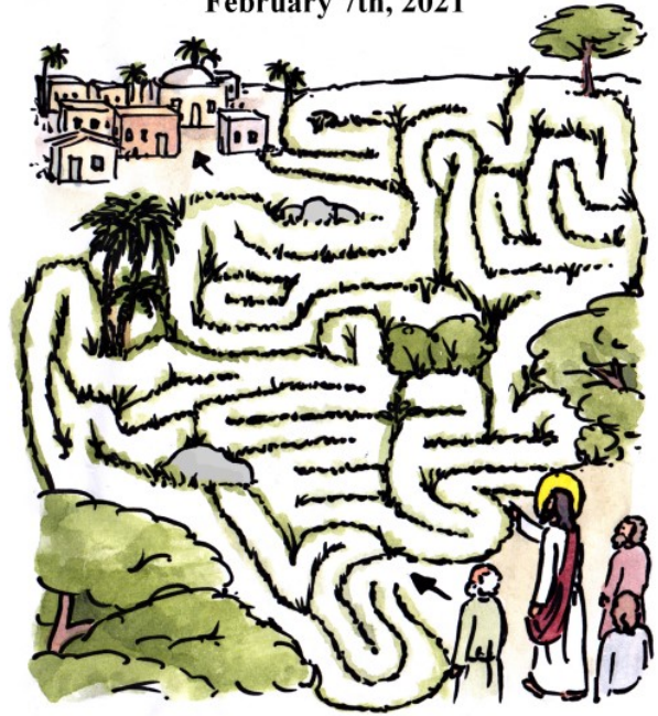
At the end of today's Gospel reading, Jesus tells Simon that they will go to the nearby villages to preach. Can you find your way through the maze to the nearby village?

Fifth Sunday in Ordinary Time February 7th, 2021