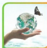
I want to make a difference