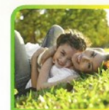
Time is precious